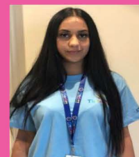
Meet our Coordinator

If you have not used our service, registrations can be completed online at www.theircare.com.au . If you need any support registering, we are more than happy to lend you a hand! We are located in the Community Hub 😊