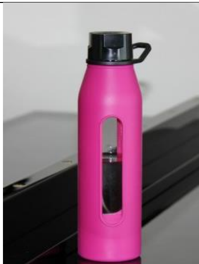
Water Bottles Labelled with child's name