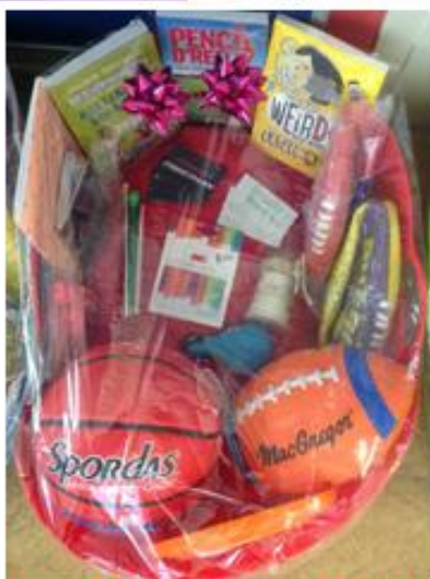
Second Prize - Worth approx. $230!

Prizes include: Fitbit Flex 2 Kmart Vouchers Xbox Vouchers PS4 Vouchers Passes to Airborn Passes to Gravity Worx Rock Climbing Gym Sports equipment and much more!