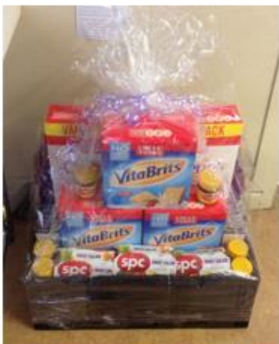
Breakfast Prize - Worth approx. $160!

ALL MONEY RAISED GOES TO THE FIGHT CANCER FOUNDATION'S EDUCATION PROGRAM