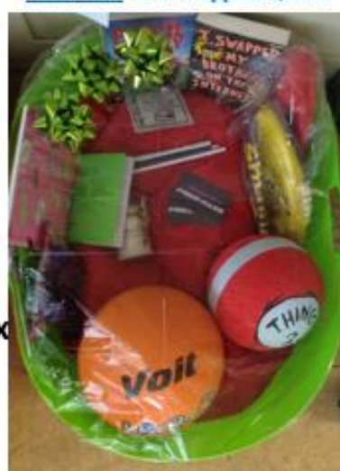
Third Prize - Worth approx. $130!

Prizes include: Fitbit Flex 2 Kmart Vouchers Xbox Vouchers PS4 Vouchers Passes to Airborn Passes to Gravity Worx Rock Climbing Gym Sports equipment and much more!