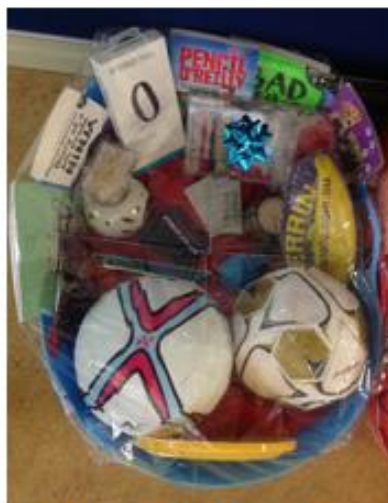
First Prize - Worth approx. $360!

$2 for 1 ticket $5 for 3 tickets Or buy more to get a special deal